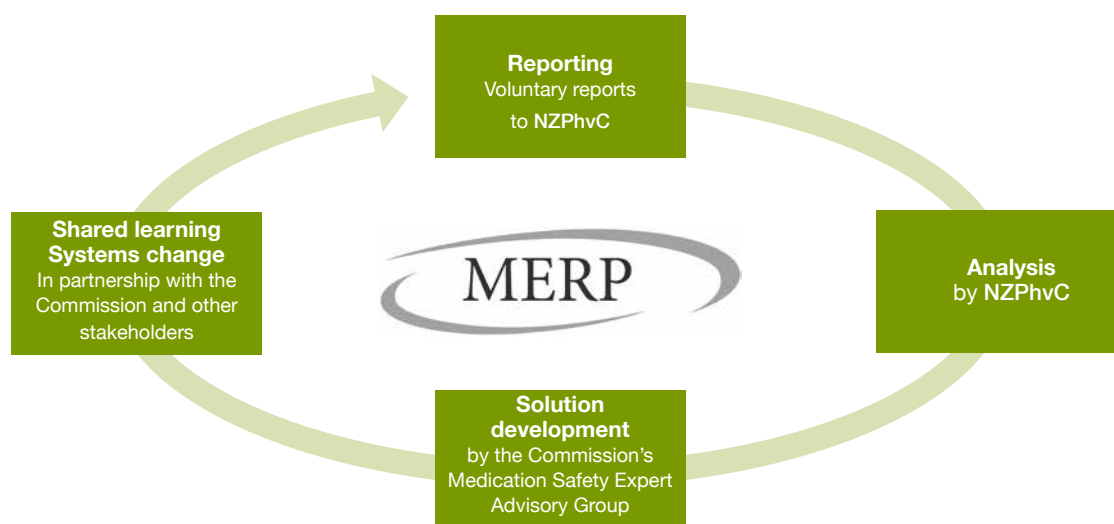
Figure 1: The MERP national reporting and learning system for primary care

If unsure, please report to CARM or phone for advice 0800 4MONITOR (0800 466648) .