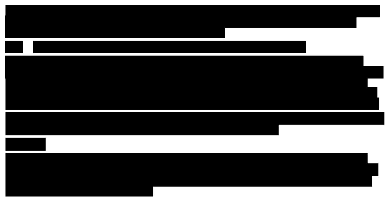
Medicines Adverse Reactions Committee: 12 September 2019