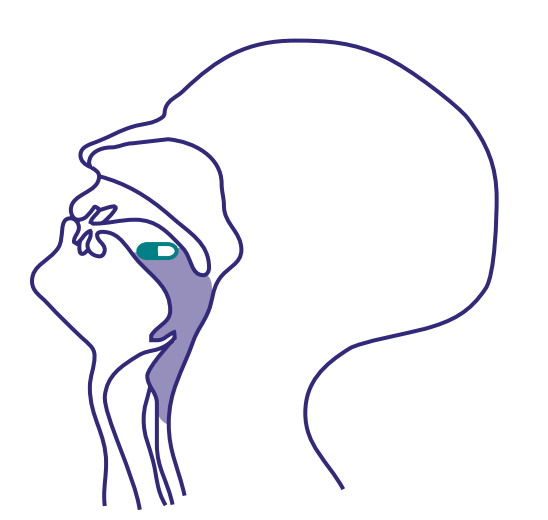
Figure 2 – Head lent forward

Instead a 'lean-forward' technique has been suggested,<sup>1,2</sup> in which the capsule floats to the back of the mouth and into a good position to be swallowed easily (see figure 2).