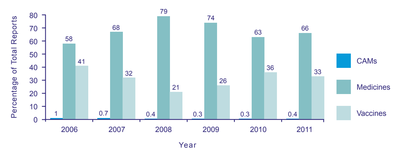
Figure 2: Types of adverse reaction reports from 2006 to 2011.

Examination of the suspected adverse reaction reports received in 2011 showed 21.7% of total reports were considered to be serious. A serious adverse reaction is determined by CARM according to internationally agreed criteria i.e. resulting in hospitalisation, life-threatening, fatal, results in a disability, requires intervention to prevent permanent disability or results in a congenital abnormality.